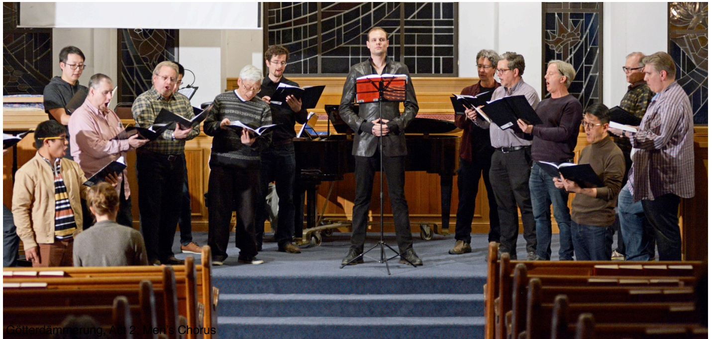
Götterdämmerung, Act 2; Men's Chorus